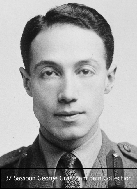
32 Sassoon