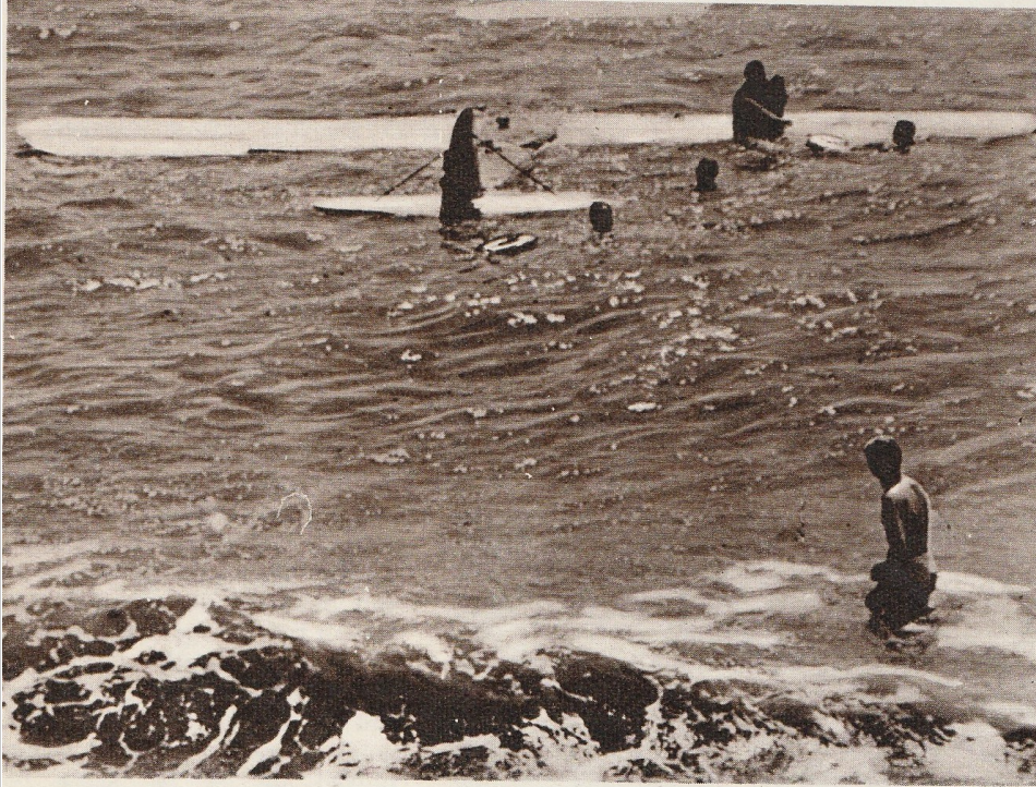
AFTER CRASHING IN THE SEA OFF THE BEACH AT HASTINGS: A SINGLE-SEATER AIRCRAFT WITH THE PILOT SEATED ON THE WING, AND RESCUERS SWIMMING NEAR. A single-seater aircraft from Lympe airfield crashed into the sea near the beach at Hastings on July 2. The pilot, a qualified commercial pilot, climbed on to a wing and was rescued by the combined efforts of three men. One swam out fully dressed; the others followed with a line and lifebelt.