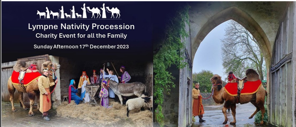
Lympne Nativity Procession Charity Event for all the Family Sunday Afternoon 17 th December 2023

IN THIS MONTHS ISSUE BUS SERVICE RETURNS, CAROLS AT THE CASTLE, CHURCH NATIVITY AND CHRISTMAS EVENTS AND MUCH MORE