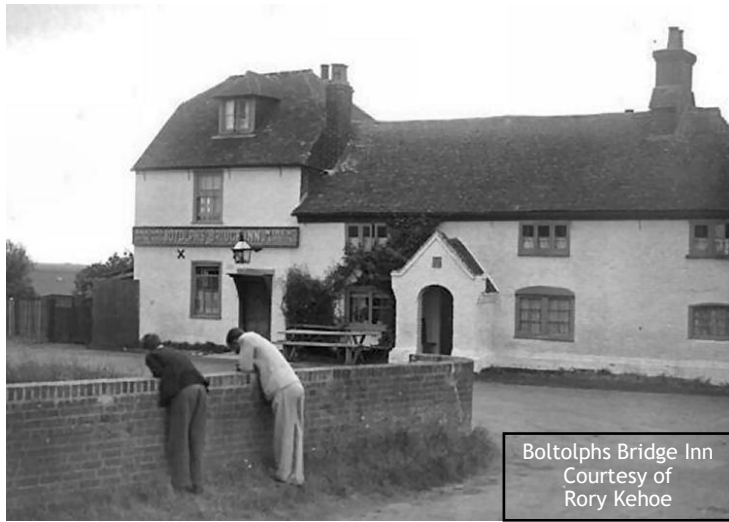
Boltolp's Bridge Inn